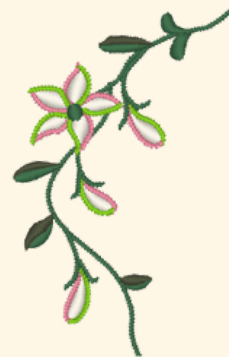
connecting bits 2