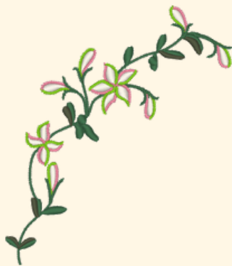
connecting bits 1